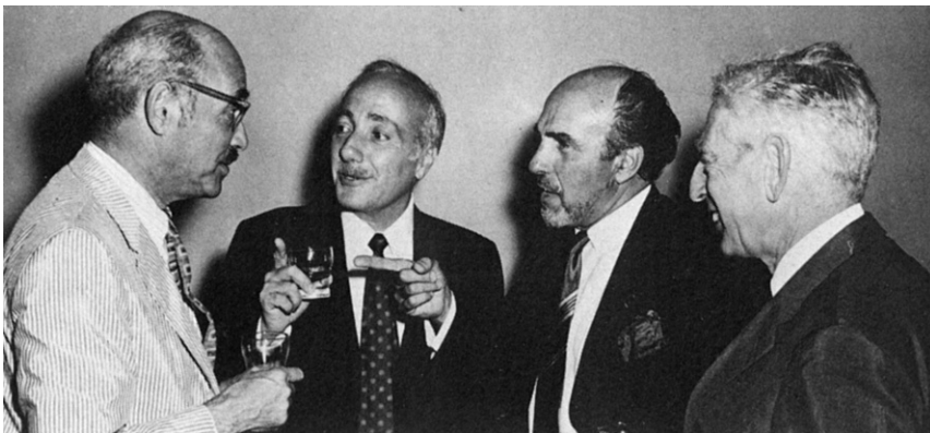
Fig. 4.2. From left to right:

Apart from requiring each society to elect a delegate the Federation rightly made no attempt